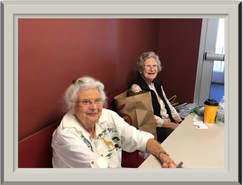
Ladies who helped with the rummage and bake sale

A HUGE THANK YOU!!! United Methodist Women would like to express our gratitude for all of the contributions of time, talents, baked goods, items for sale and support of our fall rummage sale. Your awesome help enabled us to raise more than $1,850 to support missions at home and around the world. -Jacque Patch